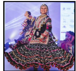
Team Gulabo (Padam Shree) (By Gulabo Sapera Nritya Evam Sangeet Sansthan , Jaipur)