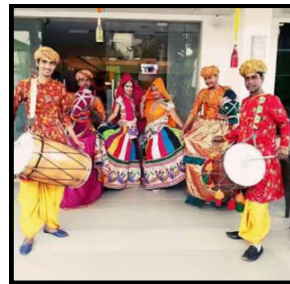
Welcome and Folk Dance and live band (By Maangal Entertainment & Event Ram Nagar)